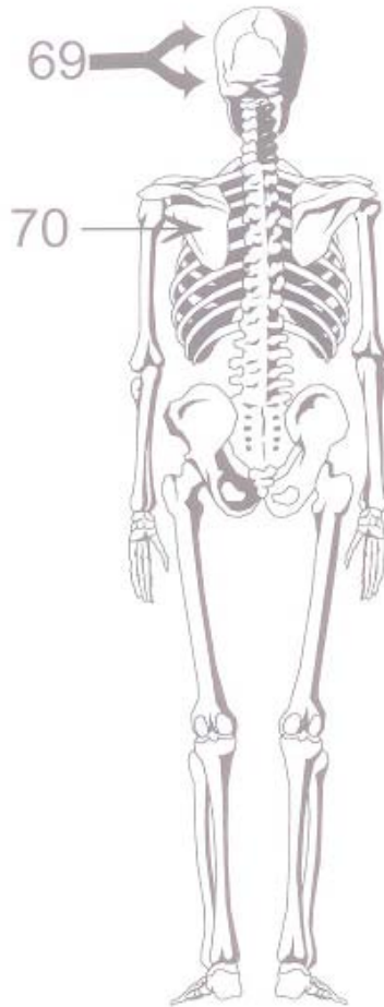
Illustration # 2